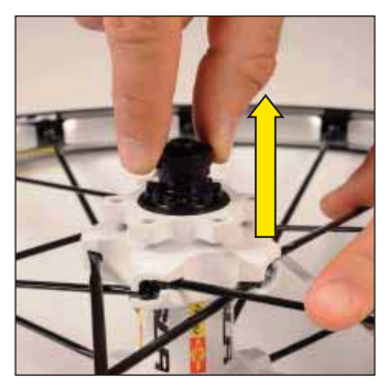
Remove the disc side frame support by pulling on it.

The cassette does not need to be removed to perform this operation.