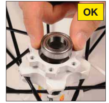
In order to ensure a perfect seal of the free wheel mechanism, the bearings of the hub body must be mounted with the disc side seal.