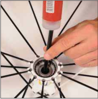
Using the press kit, remove the two bearings from the inside. Clean with a dry cloth if necessary.