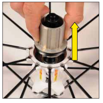
You can now remove the axle and free wheel mechanism assembly.