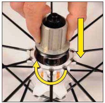
Push the free wheel body gently, rotating it anti-clockwise.