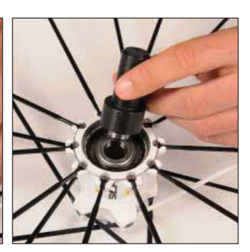
Position the drive side bearing with the disc side bearing seal. Refit the bearing with press kit M40119.