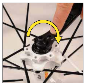
Refit the adjustment nut and the frame support.