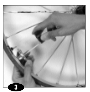
CAUTION : manipulating the integrated nipples greatly affects the spoke tension and consequently the wheel adjustment. In the final phase of adjusting the tension, 1/4 turn of the nipple corresponds to about 0.3 mm of lateral rim movement.